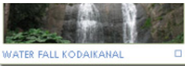
WATER FALL KODAIKANAL

Kodaikanal to Bangalore. Check in at Hotel at Bangalore. Overnight at hotel.