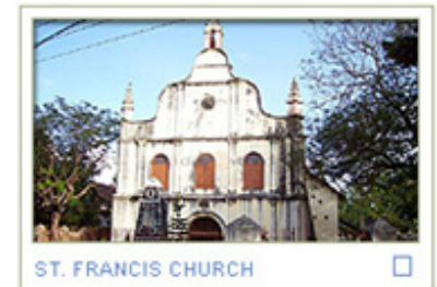
ST. FRANCIS CHURCH

After breakfast proceed to Munnar- "The Southern Kashmir of Kerala". Munnar is nature lover's paradise, and 1800 Mts.above Sea level. On arrival, check-in to the hotel/resort and relax. Overnight stay at Munnar.