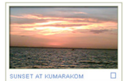
SUNSET AT KUMARAKOM

Morning after breakfast check-out from Thekkady and proceed to Kumarakom. - a unique backwater destination situated on the banks of Vembanad lake. Kumarakom is a center for House Boat cruise and Bird Sanctuary. On arrival check in to Houseboat. Overnight at A/c Houseboat.